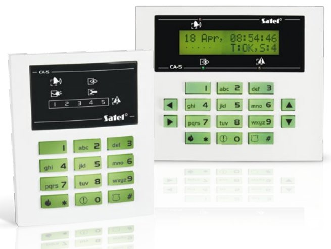
CA-5 KLED-S and CA-5 KLCD-S keypads

CA-5 Plus also provides new facilities for service technicians. It enables remote connection over GPRS to perform system diagnostics or modify its settings. There is also the function of remote updates for the GPRS module software, which allows using the new functionalities without having a service technician on site. This reduces the costs of system maintenance.