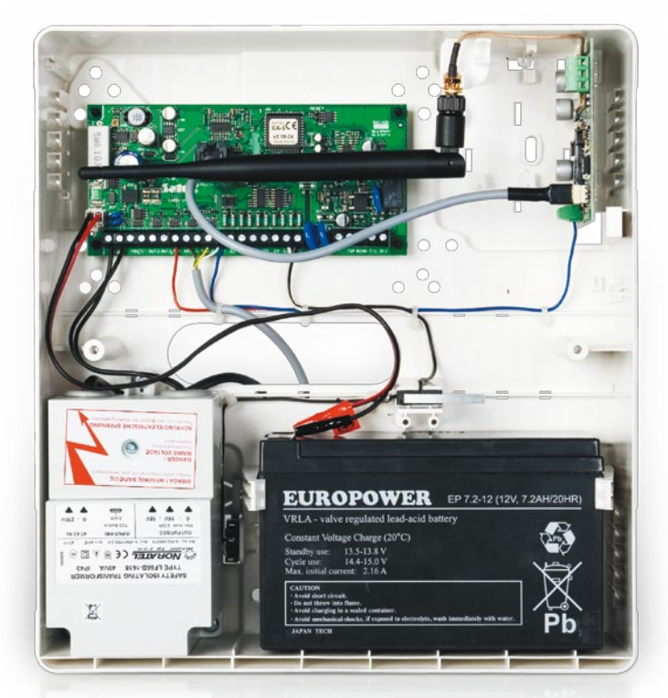
an example hardware configuration in the OPU-4 housing